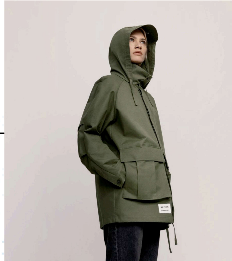
© Cyclus Unisex Parka by Halti

Transformation takes time, strategy needs to be clearly built up to take action. Define the level of real technicity you need to have in your collections, and take decisions in regard to that, whether it is recycling with new technologies, or changing finite resources to renewable ones.